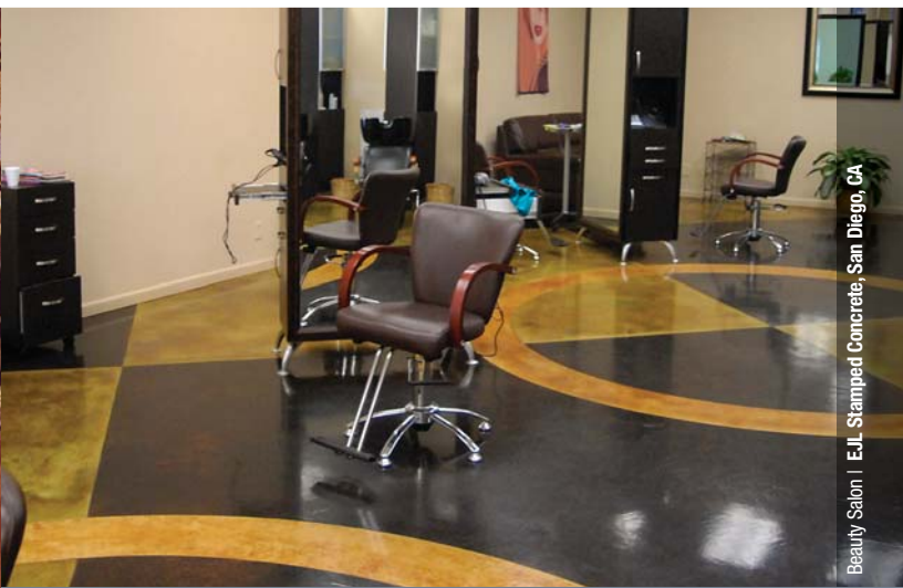
Beauty Salon | E.J.L. Stamped Concrete, San Diego, CA

Enhance the look of old and new concrete surfaces with Concrete Solutions® Acid Stain System. Acid Stain uses the chemical reaction between blended metallic salts in the stain and the hydrated lime in the hardened concrete to create rich and translucent tones, giving character to ordinary concrete. Combined with one of the Concrete Solutions clear coats, the Acid Stain system offers endless, lasting color possibilities and multi-hued color effects.