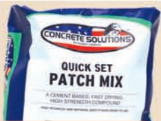
Quick Set Patch Mix