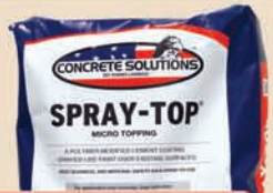
Spray-Top® Polymer Cement