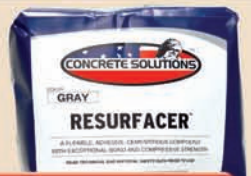
Resurfacer (White or Gray)