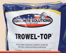
Trowel-Top™ Polymer Cement