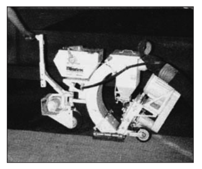
For commercial jobs shotblast the surface

Indoor Jobs – Shot-blasting is recommended to prepare the surface for most indoor jobs. If shot-blasting is unavailable scrub with detergent, acid wash, neutralize, rinse and wet/dry vacuum. (See the Concrete Solutions Training Manual under Surface Preparation for more detailed instructions.)