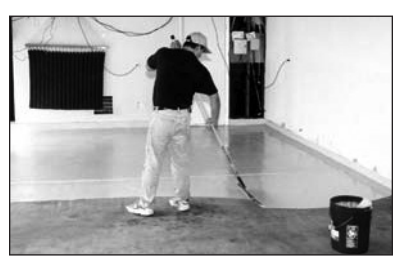
Apply Epoxy 200 with metal squeegee

Before applying the Concrete Solutions Color Flake or Quartz System, the surface should be smooth to achieve the best possible finish. If needed, patch any holes, spalls or deteriorated areas of the surface using the Epoxy 500 and sand mix used for the cracks or Concrete Solutions Quick Set Patch Mix.