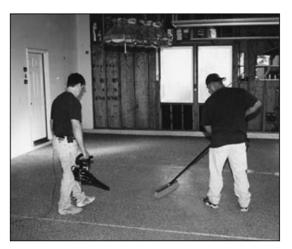
Scrape surface and blow to remove loose flakes or quartz