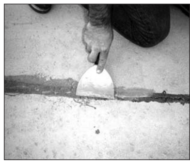
Fill cracks with Epoxy 500 and sand mix

After the surface preparation is completed, a wet dry vacuum can be used to remove any excess water from cracks and/or joints prior to repairing them. When dry to touch, fill the cracks with Concrete Solutions Epoxy 500 that is mixed with one to two parts #60 or 90 silica sand using a stiff putty knife. If desired, joints can be filled with Concrete Solutions Epoxy 800 (Flexible) mixed with #60 or 90 silica sand to provide a seamless floor or the joints can be left open.