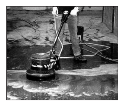
Detergent scrub, acid wash, neutralize

Outdoor Jobs – Clean the existing concrete surface to be coated by power scrubbing with detergent, acid washing, neutralizing and pressure washing at 3000 psi or more using a 15 degree or spinner tip. The surface must be clean of dirt, oil and any other contaminants that may interfere with bonding. Grinding or shot-blasting are other popular methods.