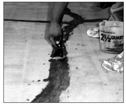
Scrape excess epoxy, leave little above crack