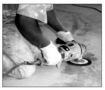
Grind epoxy over crack, smooth with surface.

After filling the cracks and/or joints, scrape the excess epoxy off the surface. For fine cracks 1/16 - 1/8", scraping the excess epoxy off the surface should be sufficient to complete the repair. For larger cracks over 1/8" wide, it is best to fill the cracks with the Epoxy 500 sand mix and the joints with the Epoxy 800 sand mix (if desired), then to scrape all the excess epoxy off the surface except for directly above the crack and/or joint. Leave a thin layer of the epoxy directly above the crack and/or joint and allow it to dry at least 4 - 6 hours. When the epoxy has dried