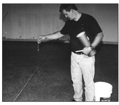
Sprinkle flakes into urethane if needed to even look