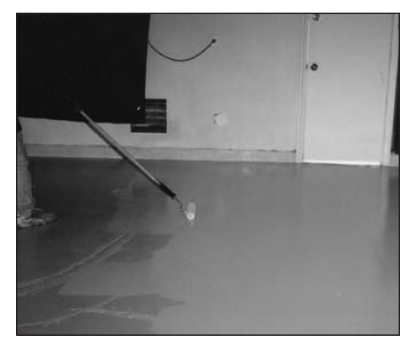
Spread thin with 3/8" nap paint roller

Have the color flakes or quartz ready in a two gallon bucket. Starting in one corner of the floor, apply the Epoxy 200 Color or WB Epoxy Color to the edges using a paint brush. After edging approximately 10 feet, pour a thin row of Epoxy 200 Color or WB Epoxy Color a few feet from the starting edge and begin spreading it over the floor in a thin, even coat approximately 200 – 250 sq. ft. per gallon, using a 1/4" - 3/8" nap paint roller.