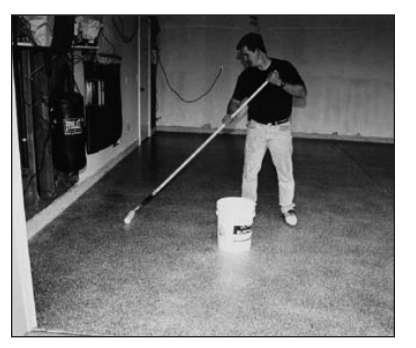
Apply first coat of SB Urethane over flakes

Rhino Linings Corp. recommends using slip resistant granules in all outdoor applications where the SB Urethane will be used as a topcoat sealer and on indoor applications that may be exposed to water, oil or other spills that may cause a slippery environment. Aluminum oxide granules #80 grit or courser may be broadcast into the prime coat to achieve the amount of slip