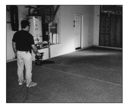
Blow loose flakes to thin areas only if needed

Another method to use if you run out of flakes near the end of a job, is to use a blower while wearing spiked shoes to carefully blow excess loose flakes from the completed areas to the unfinished areas where more flakes are needed.