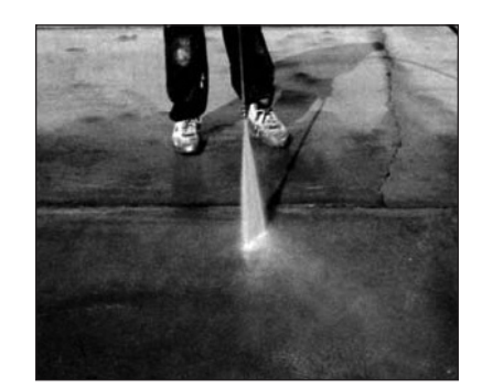
Pressure wash surface to clean and rinse