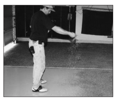
Sprinkle by hand for light to medium coverage

Broadcasting Flakes or Quartz on Vertical Surfaces: For vertical surfaces throw the flakes at close range against the coated vertical area until completely covered. If a medium broadcast is desired, throw smaller finger fulls of flakes against the vertical surface to achieve the desired look. It is easier to do the vertical areas first allowing them to dry to touch approximately one hour before doing the horizontal surfaces.