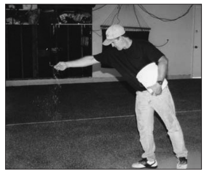
Sprinkle flakes in thin areas or next to edges

Continue rolling and broadcasting until the entire surface is covered. Be careful not to broadcast more flakes or quartz than necessary to avoid running out before the job is completed. If it looks like you may run out, stop next to a joint to avoid having a seam line or, if there are no joints, be sure to get at least partial coverage over the entire area with the remaining flakes.