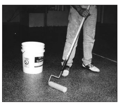
Apply second coat of SB Urethane